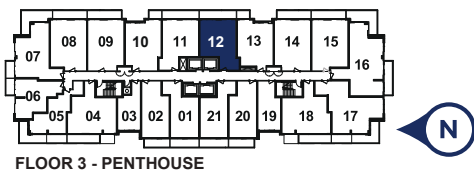
FLOOR 3 - PENTHOUSE